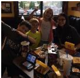
Students enjoying PTA Spirit Night at Zaxby's