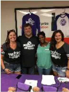
Spirit wear sales

Click for a full list of 2017-2018 volunteer opportunities – with contacts!